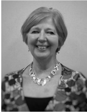
GILL GEORGE THE GOOD SPIRIT